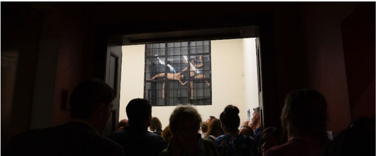
Burn (Sofia - BU)

Due to the ongoing nature of the concept, this proposal can be subject to change, in order to move towards the individual partners' objectives. We would welcome a more detailed discussion about context, possibilities, and the overall framework.